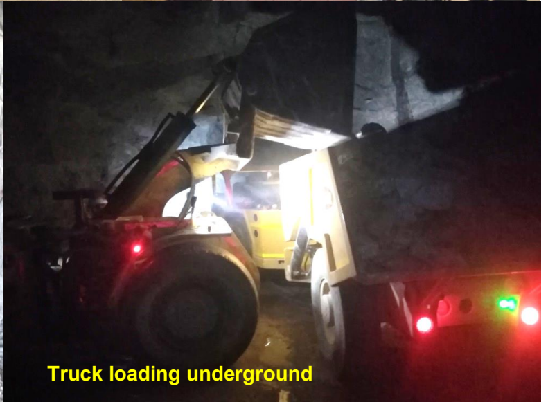
Truck loading underground