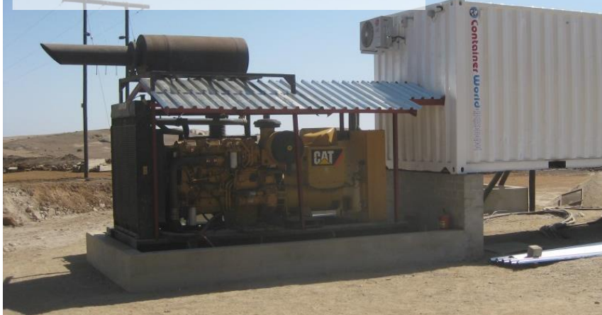
Back-up generator at main substation