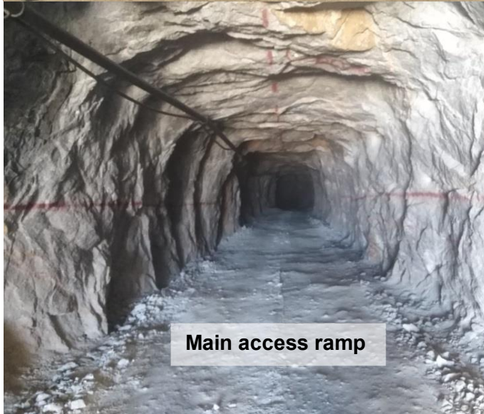
Main access ramp