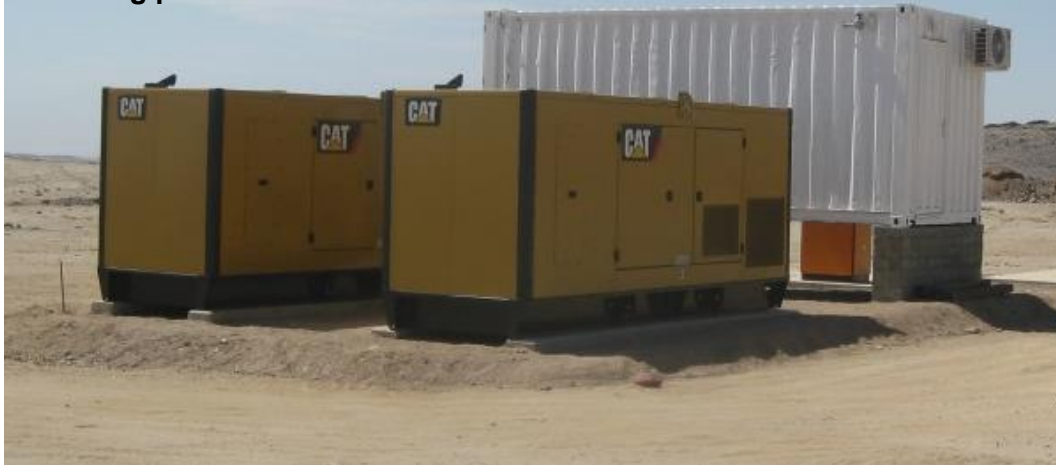
Mining power station